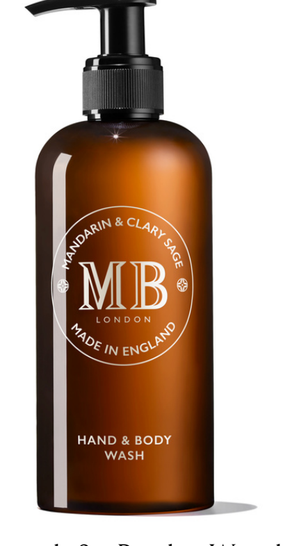
Hand & Body Wash