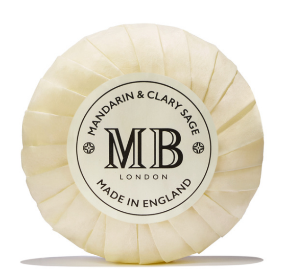
Mandarin & Clary Sage Soap