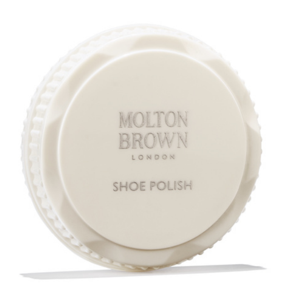
Shoe Polish (Resealable)