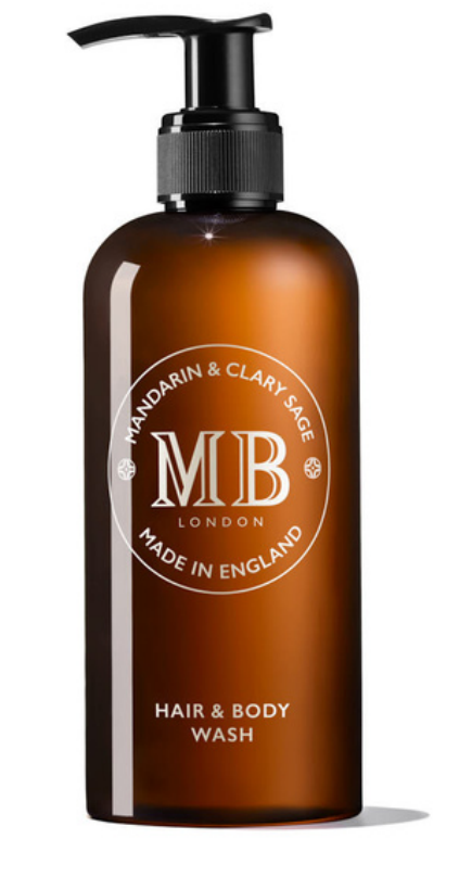
Hair & Body Wash