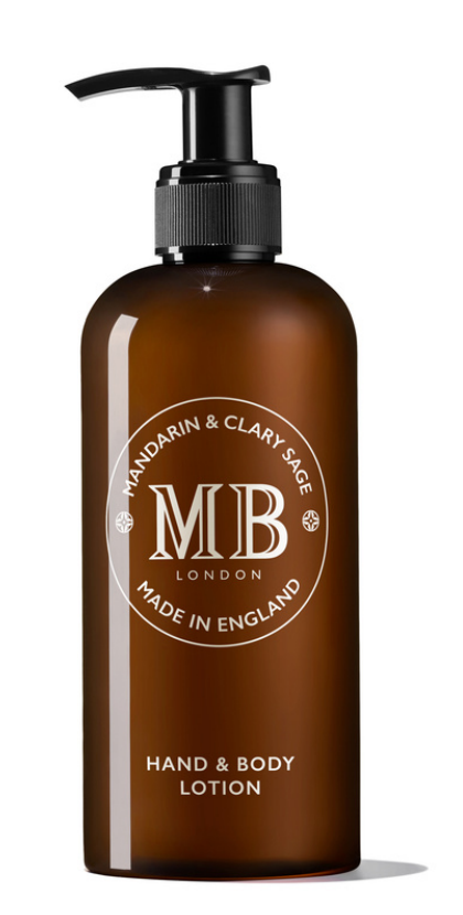
Hand & Body Lotion