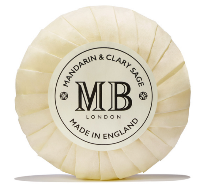
Mandarin & Clary Sage Soap